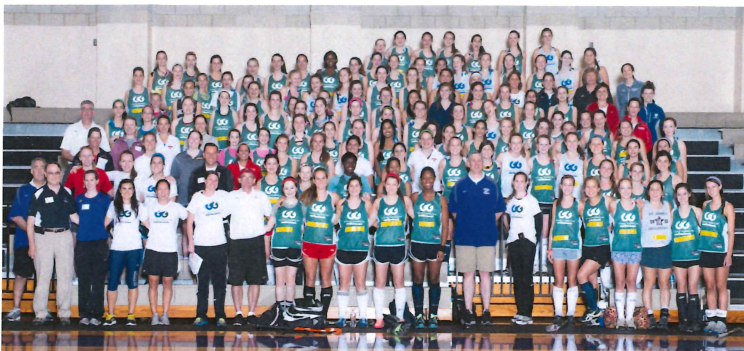
2014's players, coaches, umpires, and instructor coaches